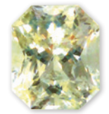
White Sapphire 8.3 x 7.0mm, 2.56ct