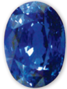
Blue Sapphire 12.0 x 8.5mm, 6.21ct