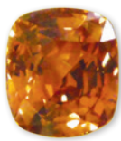
Bronze Sapphire 6.8 x 5.9mm, 2.10ct