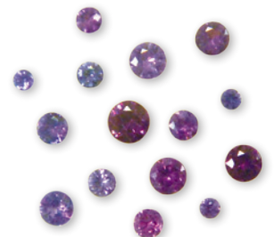
Diamond Cut Purple Sapphires, 1.32ct

Phone or email us and our experienced staff of gemmologists will be pleased to assist you. Visit our website to view a selection of current stock and source valuable information regarding gemstones.