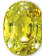
Unheated Yellow Sapphire, 9.0 x 6.7mm, 3.08ct