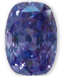
Purple Sapphire 7.9 x 5.7mm, 2.09ct