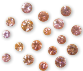
Diamond Cut Peach Sapphires, 1.60ct

Phone or email us and our experienced staff of gemmologists will be pleased to assist you. Visit our website to view a selection of current stock and source valuable information regarding gemstones.