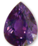
Purple Sapphire 7.9 x 6.0mm, 1.36ct