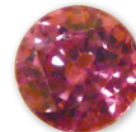
Unheated Padparadscha Sapphire 5.1mm, 0.78ct