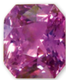
Pink Sapphire 8.7 x 7.3mm, 3.08ct