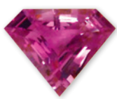
Pink Sapphire 8.2 x 6.7mm, 0.92ct