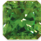
Green Tourmaline 10.6mm, 6.14ct