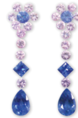
Sapphire Set 2.38ct