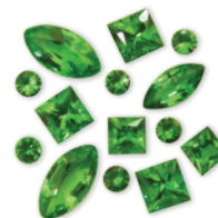
Tsavorite Garnets 1.59ct