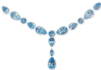
Aquamarine Set 6.13ct