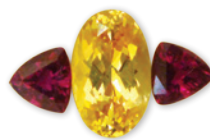
Ruby & Yellow Sapphire Set 1.66ct