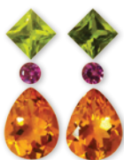
Peridot, Citrine & Garnet Set 5.45ct