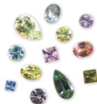
Unheated Sapphires 2.70ct