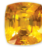
Yellow Sapphire 7.0 x 6.5mm, 2.04ct