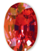
Spinel 9.5 x 6.6mm, 1.98ct