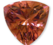
Pink Tourmaline 10mm, 3.49ct